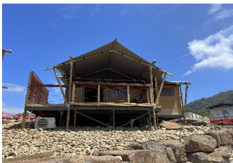
A Beach Tent